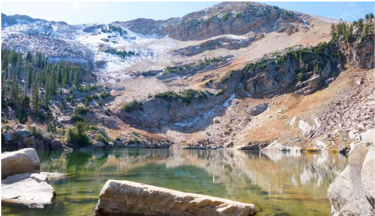
Secret Lake sits at the bottom of Devils' Castle- an iconic rocky butte at the top of Alta Ski Resort

Secret Lake - ~40 minute drive from campus, but if you want to see the mountains on this trip, a drive up Little Cottonwood Canyon is well worth it! Stay for lunch or dinner, or head over to Snowbird's Oktoberfest celebration down the road on the weekends. Drive up the summer road ($12 per car fee) to park at the upper campgrounds and make for an easy hike. This hike at Alta Ski Resort is an easy 1.8 miles RT and ~400 ft of elevation gain through beautiful high mountain meadows up to a serene lake. Make it more challenging (and skip the parking fee) by parking at the Albion Lodge lot at the bottom of the resort, which adds an additional 2 miles and 800 vertical feet of hiking. No dogs allowed.