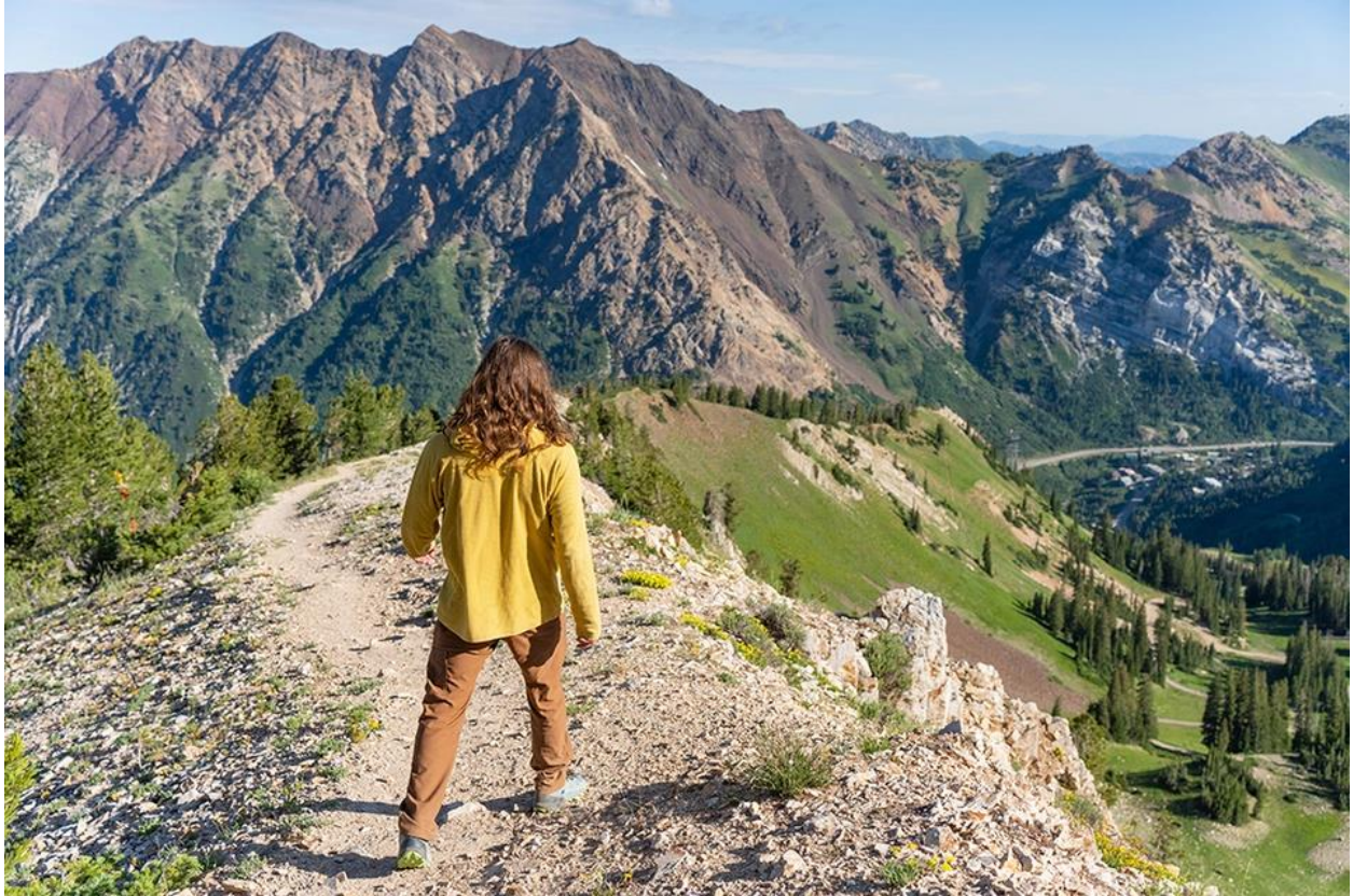
Walking down the cirque trail from the top of Hidden Peak. This ridgeline trail offers spectacular 360-degree views of Little Cottonwood Canyon.